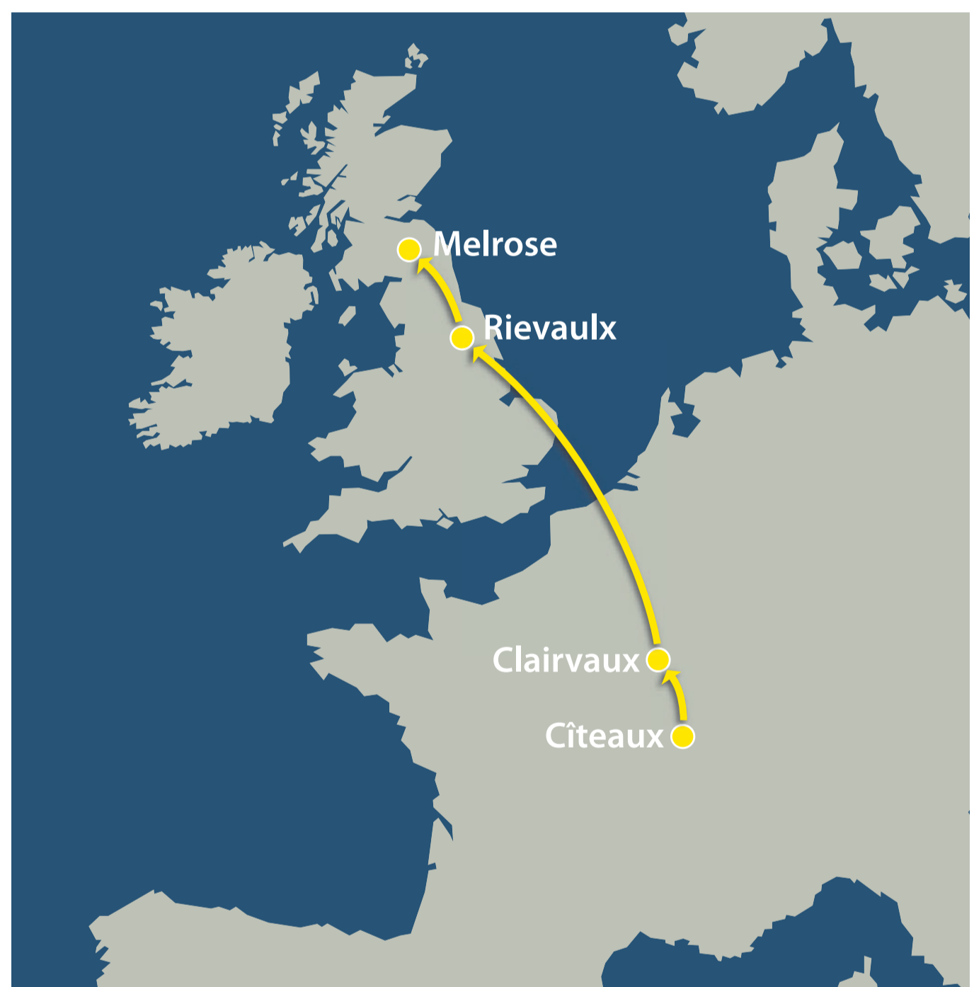
The map shows the sequence of Cistercian foundations from Cîteaux to Melrose, founded by King David I in 1136.

New monasteries were part of this process of Europeanisation, inspired by a shared desire across Europe to create a more Christian society. Some formed networks, none more so than Cistercian monasteries which spread throughout Europe. At the same time, monasteries identified with their local patrons (kings, queens, lords and ladies) who supplied them with property and privileges in exchange for regular prayers.